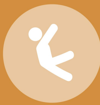
FALLS, SLIPS AND TRIPS