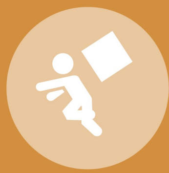
BEING STRUCK OR AGAINST AN OBJECT